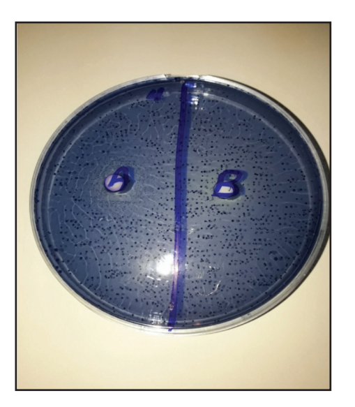
Figure (1) Antibacterial effect of pit & fissure sealants against streptococcus mutans

Group A showing antibacterial effect, Group B didn't show antibacterial effect