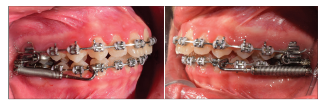
Figure (1) Intra-oral view of FFRD