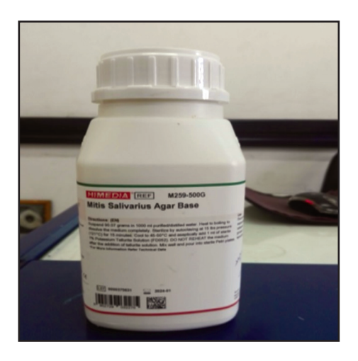
Figure (1) Mitis Salivarius Bacitracin Agar Base.

Case Selection: Ethical approval was obtained from the Research and Ethics committee of the Faculty of Dental Medicine of Al-Azhar University (Girl's branch), Cairo – Egypt, the study was explained to all the participants' guardians, and they signed informed consent denoting their agreement