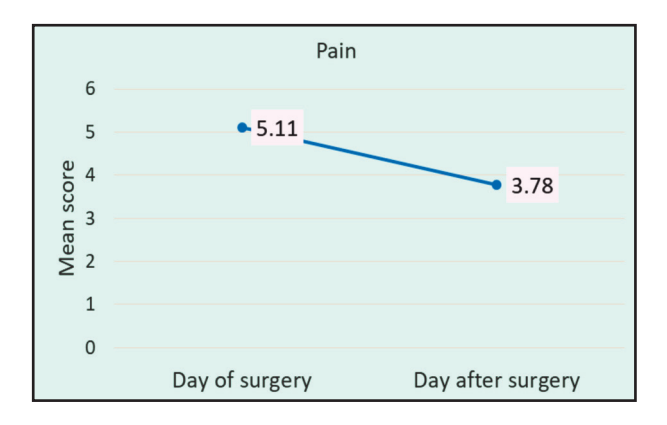
Figure (5) Line chart showing mean pain score post-surgical in laser group