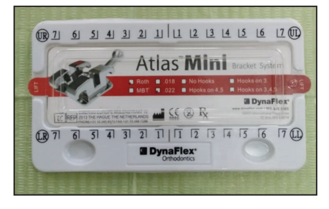
Figure (1) Straight wire 0.022-in slot Roth appliance

The foremost phase of teeth alignment and leveling was completed first with a straight wire 0.022-in slot Roth appliance. (Fig. 1)