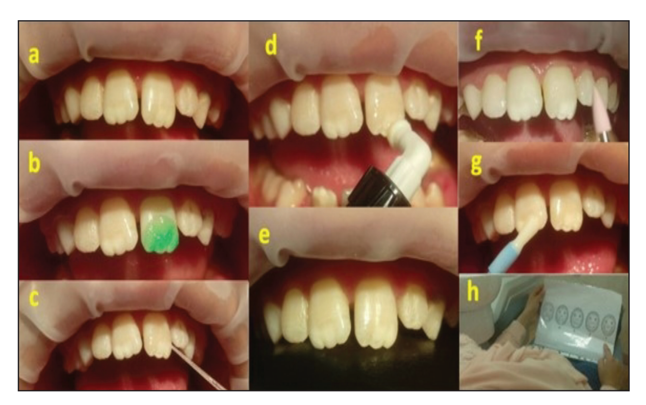
Figure (1): (a,b,c,d) and (e) Representing steps of resin infiltration, (f) Finishing of resin, (g) Application of fluoride varnish, (h) Facial image scale assessment