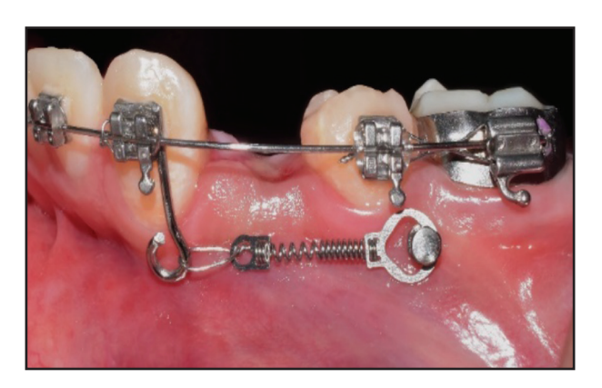
Figure (1): Canine retraction mechanics

canine lines and the central fossae line -a line passing through the central fossa of the right and left second molars- were measured. The patients were given a questionnaire and asked to assess the level of pain after 1 hour, 12 hours, 24 hours, and at days 3, 5 and7 following the intervention procedure and after the first canine retraction with a numeric rating scale (NRS). The NRS was also used to rate the satisfaction of the BMSCs' aspiration and injections procedures and their easiness, fig (1).