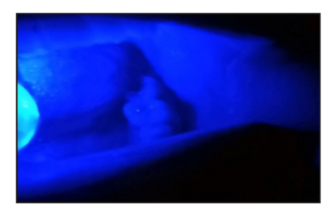
Figure (1) Examination using Vizilite technique.

All patients were asked to rinse their mouth with water for about 30 seconds to remove debris followed by rinsing the mouth with the Vizilite TM rinse (1% acetic acid solution) for one minute. The room light was dimmed to minimize the ambient light. The Vizilite TM capsule was activated by sharp bending, and assembled within the Vizilite retractor. The oral cavity was re-examined using the illumination from the Vizilite assembly (Fig. 1). The presence of a characteristic "acetowhite" area was considered to be a "positive" result. The absence of such findings was considered a "negative" result.