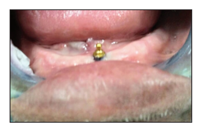
Figure (1) Final placement of implant with ball and socket attachment.

According to patients grouping, ball attachments and their housings were picked up. In Group I, covering screws were located by the aid of the surgical stent of the patient and they were then removed. Ball and socket attachment was then applied after 3 months. In Group II, ball attachment was already applied during the surgery, however the implant loading was done at the 7th day of surgery by picking up the metal house and the matrix (Fig. 1).