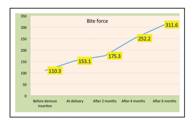
Fig. (3): Line chart showing mean values of bite force at different time intervals.

Tukey's post hoc test: means sharing the same superscript letter are not significantly different.