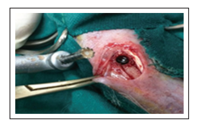
Fig. (1) The bone defect was created using trephine bur with dimensions of 4mm width and 5mm depth.

only gel foams. The wound was closed in layers by absorbable suture material.