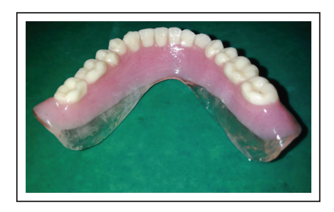
Fig. (1) The mandibular denture with the flexible lingual flanges

Before insertion of dentures with flexible lingual flanges, the mandibular denture was immersed in hot water bath (95°C) for 5 min to soften the flexible flange, so that they can be easily adjusted to adapt the undercut area of the mylohyoid ridge.