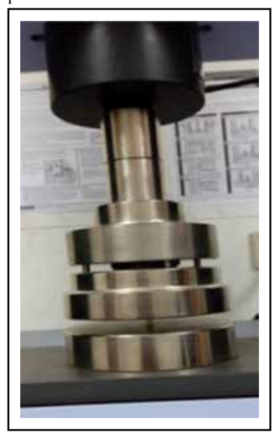
Fig. (2): Universal testing machine used for compressive strength testing