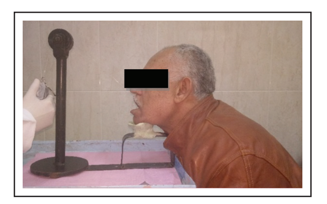
Fig. (2) Measuring retention of mandibular denture