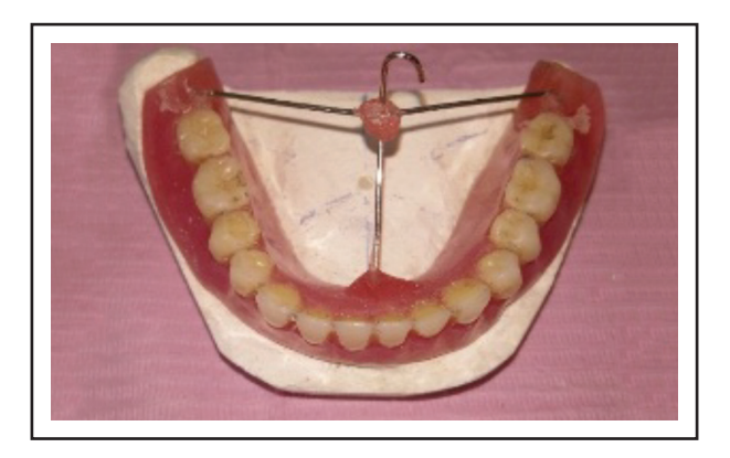
Fig. (1) Geometric center of lower denture.

A digital force meter (Untied States) was used to measure denture resistance to vertical displacement (i.e., retention) by applying a pulling force on a metal hook located in the geometric center of each mandibular conventional denture that was identified on the lower cast at the intersection of three lines bisecting the angles of the triangle, formed by both retromolar pads and the midline (Fig.1).