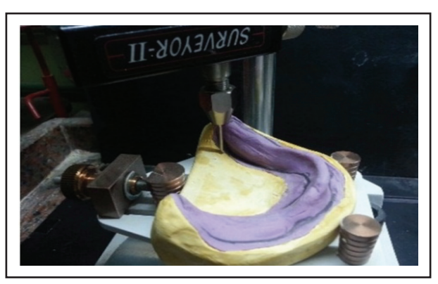
Fig. (3) Surveying and underlining lingual undercut.