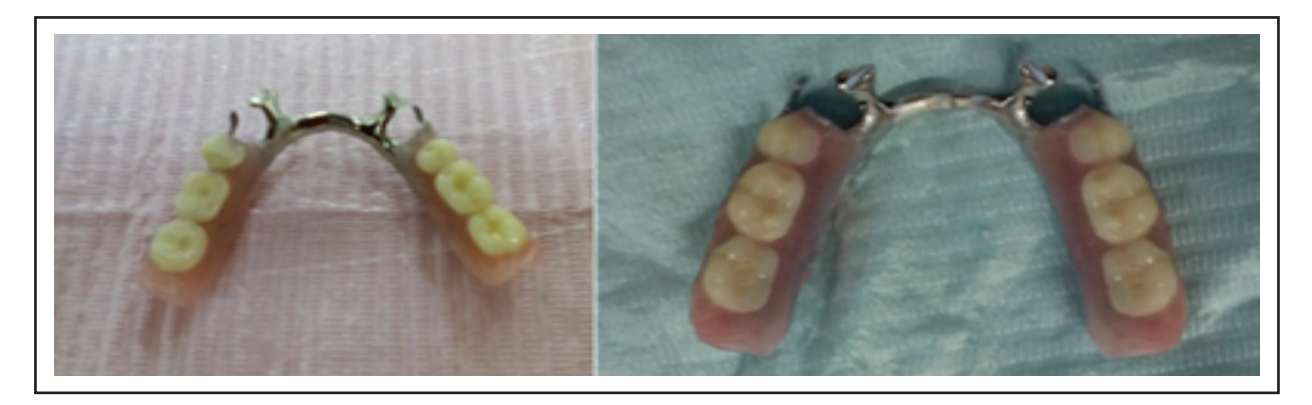
Fig. (1): Left: Finished RPD with flexible base, right: Finished RPD with O.R base.

formed at the time of denture insertion, three, six and nine months after insertion.