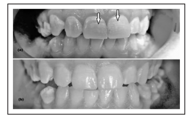
Fig. (1): Patient with white spot lesions (a) before tretment (b) after three months from Curodont repair treatment