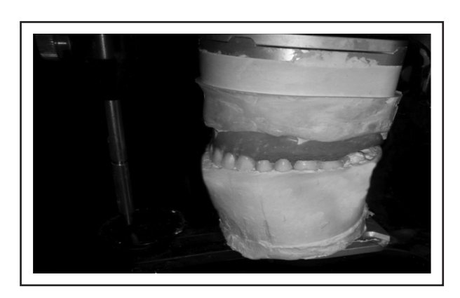
Fig. (2): Occlusal index for single maxillary denture on the articulator.