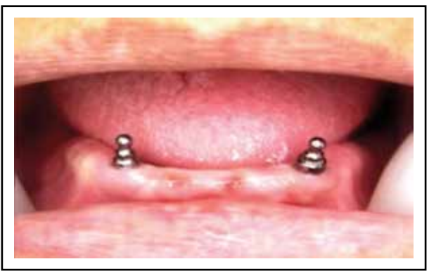
Fig. (2) The two ball attachments in place.

rubber O-rings were incorporated into the ball abutments and the mandibular denture was checked for stability over the two ball abutment. Undercuts under the sockets were blocked out with soft wax. Immediately loaded implant with ball and socket attachment. (Figure 2)