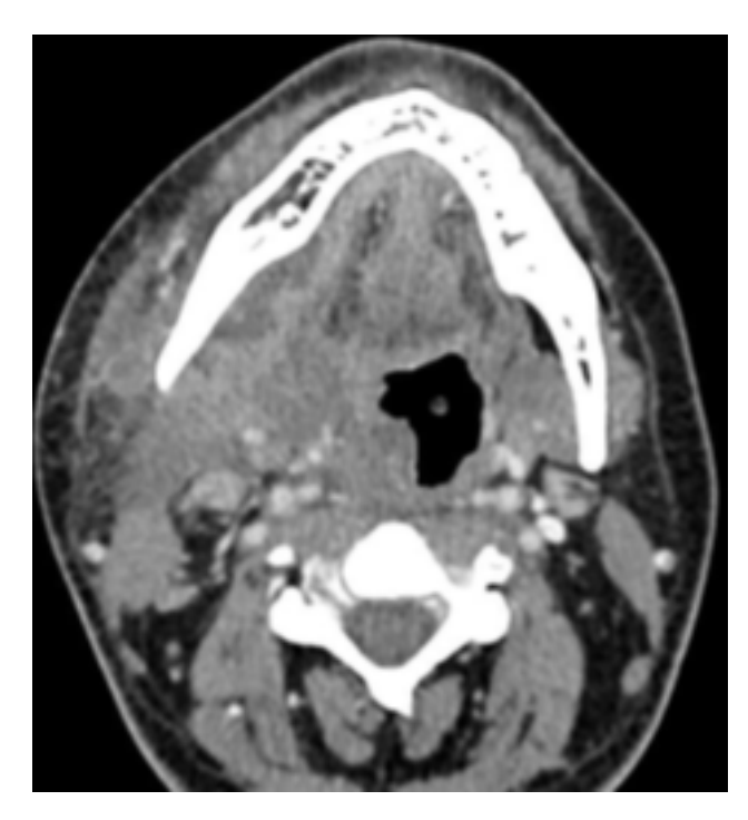
Fig. 4b: Contrast enhanced neck CT Coronal and axial views (A and B) of a contrast enhanced neck CT show a right submandibular and sublingual heterogeneously enhancing abscess (thin arrow) extending superior and medially into the right parapharyngeal and masticator space (thick arrow). The oropharynx was compressed and displaced to the contralateral side.