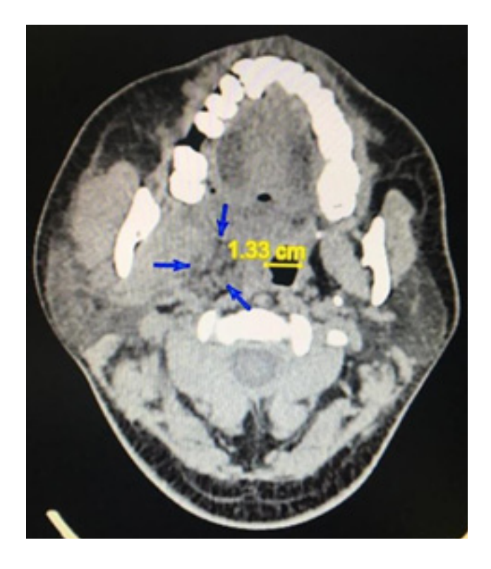
Fig. 3: Hypodense area at the right submandibular and sublingual region measuring 3 cm (AP) X 1 cm (W) X 3 cm (CC) with the oropharynx compressed to the contralateral side by a distance of 1.3 cm.