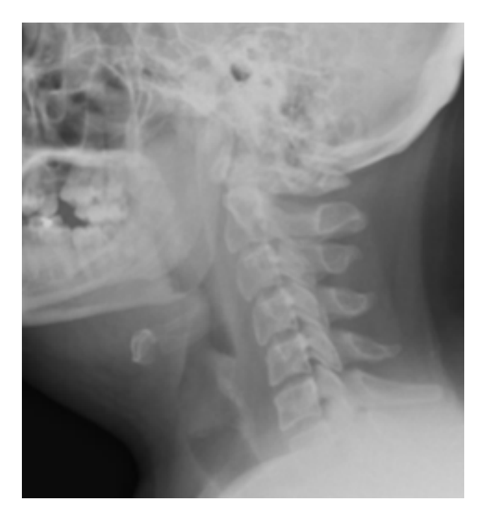
Fig. 2: Plain radiograph of the neck (lateral view) showing soft tissue opacities overlying the nasopharynx and oropharynx region at the level of the C1 and C2 vertebrae.