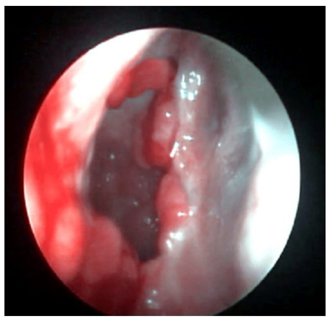
Fig. 3: Granulations in the right new choana