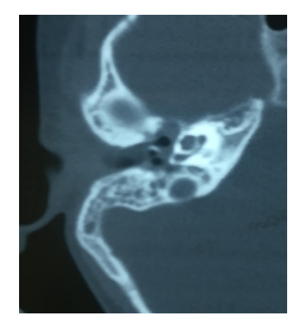
Fig. 2: CT scan of the brain and the petrous temporal bone showed a subtotal filling of the right middle ear.

A CT scan of the brain and the petrous temporal bone showed a subtotal filling of the right middle ear, and the cavernous sinus was clear (Figure 2).