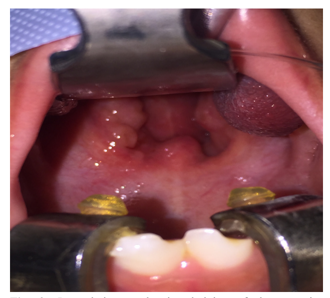
Fig. 2: Introral image showing bulging of the posterior oropharyngeal wall.