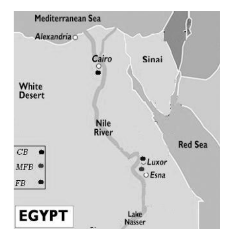
Fig. (4): Site map of CB, MFB and FB brick samples from