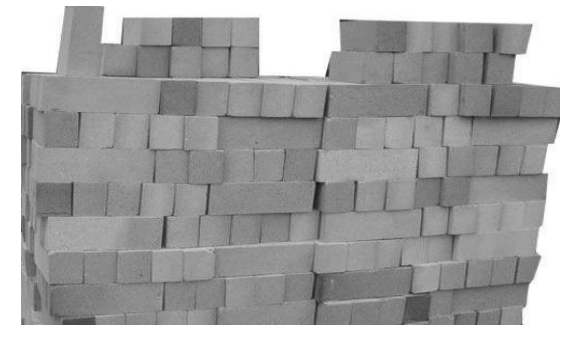
Fig. (2): Fire Brick (FB)