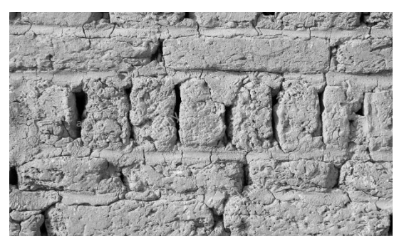
Fig. (1): Clay Brick (CB)

FWHM at the 1332.5 KeV peak of <sup>60</sup>Co shielded by a lead cylinder.