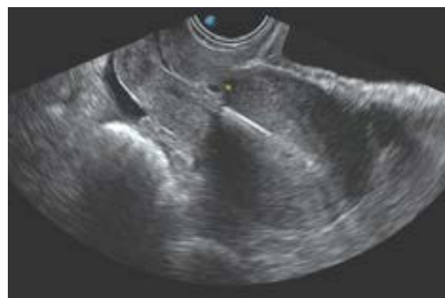
Fig. 2: Ultrasound image shows cervix and body of uterus are in same axis as ultrasound beam, with Cesarean scar defect (a filling defect) within the myometrium of the lower uterine segment

Anteversion was considered present when the transducer abutted the anterior border of the cervix and the cervix appeared on the viewer's right in the sagittal plane. Retroversion was considered present when in the sagittal plane the transducer abutted on the posterior border of the cervix and the cervix appeared on the viewer's left. Flexion was any deviation of the long axis of the endometrial lumen from the long axis of the cervix, resulting in anteriorly directed ante flexion and posteriorly directed retro flexion. Ante flexion was defined as a flexion angle of 180 or less, whereas retro flexion was defined as a flexion angle of 180 or greater.