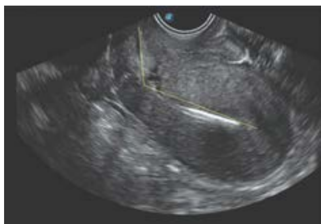
Fig. 5: Woman with retroverted retroflexed uterus. Yellow lines show the flexion angle measurement between the uterine cervix and uterine corpus. The angle between cervix and body of uterus greater than 15