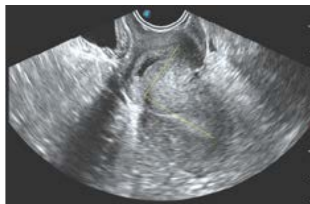
Fig. 6: Woman with anteverted retroflexed uterus. Ultrasound image shows cervix angled anteriorly and fundus is angled posteriorly and is at right-angle axis to cervix. Yellow lines show the flexion angle measurement between the uterine cervix and uterine corpus (279.9)