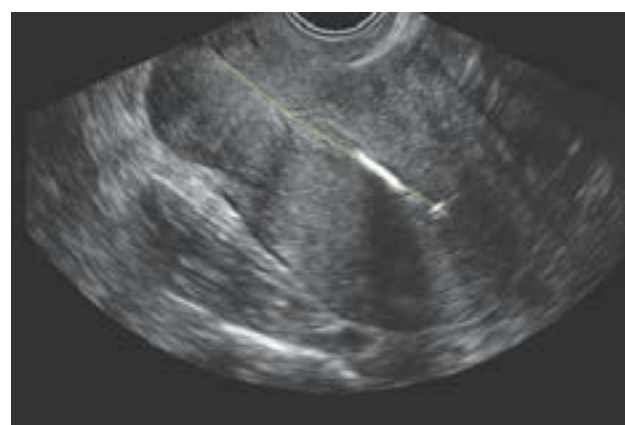
Fig. 8: woman with axially positioned uterus. Ultrasound image shows cervix and body of uterus are in same axis as ultrasound beam