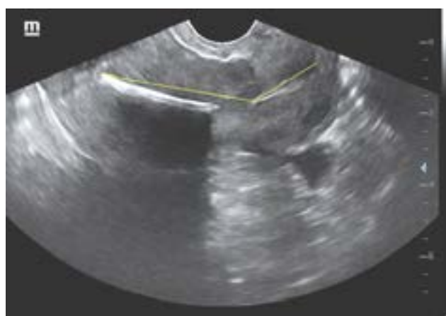
Fig. 4: Woman with anteverted anteflexed uterus. Yellow lines show the flexion angle measurement between the uterine cervix and uterine corpus. The angle between cervix and body of uterus greater than 15