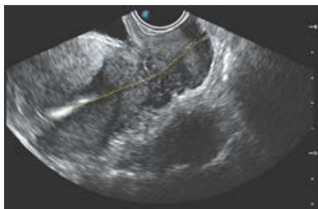
Fig. 3: Woman with anteverted uterus. Ultrasound image shows cervix and body of uterus are at almost at same axis. Yellow lines show the flexion angle measurement between the uterine cervix and uterine corpus (168.7)