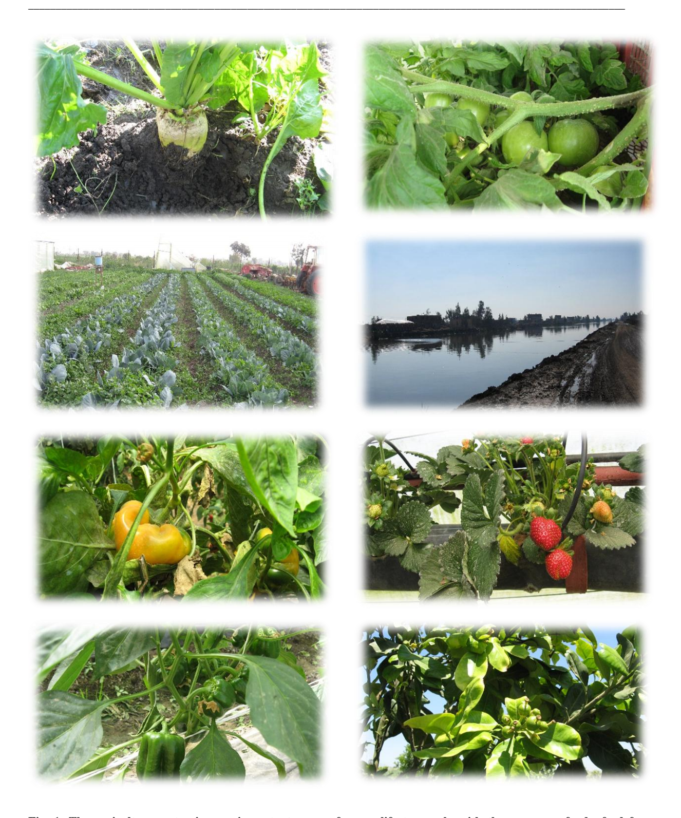
Fig. 1. The agriculture sector is very important source for our life to supply with the necessary foods, feed for our animals, fiber and fuel. The pictures are presenting different sectors in the agriculture including sector of vegetables, fruits, and agricultural drainage water.