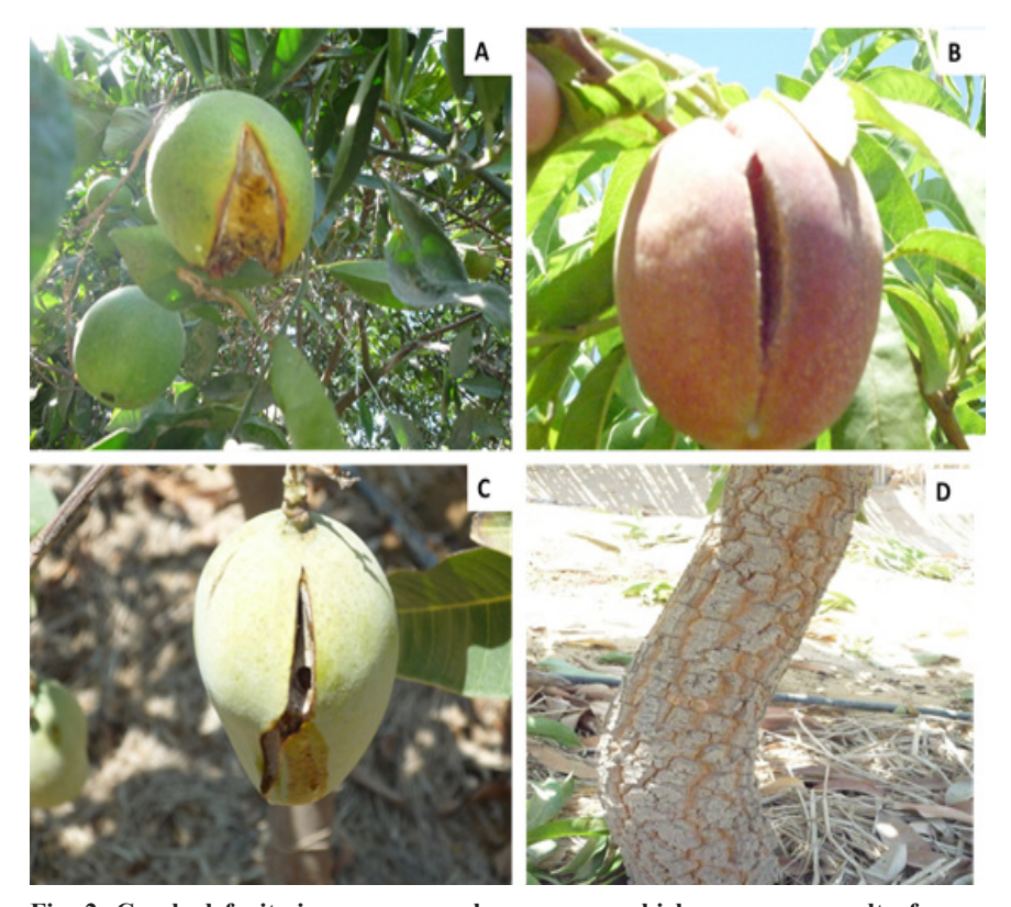
Fig. 2. Cracked fruits is a common phenomenon, which may as a result of errors in agricultural operations. (A) orange fruit (B) peach fruit (C) mango fruitcomparing with (D) cracked stem mango.