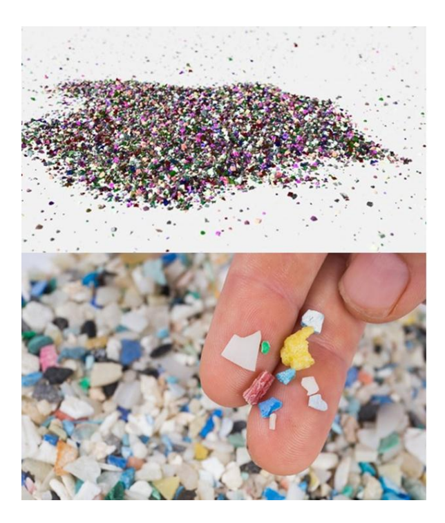
Fig. 1. Microplastic particles

The sources of MPs will differ from ecosystem to other (Fig. 2). The defragmentation of larger plastics on coasts owing to oxidation, heating, and radiation is the primary source of MPs in the aquatic environment (Palmer and Herat, 2020).