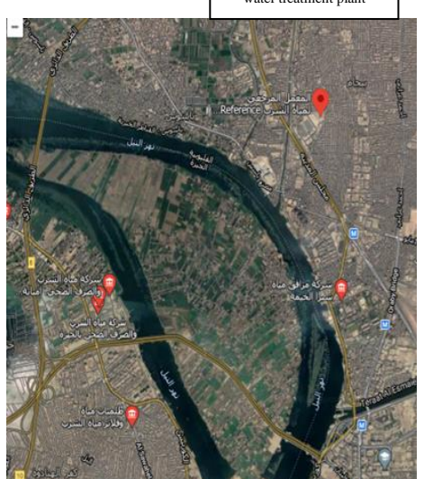
Fig. (1) Sampling Site