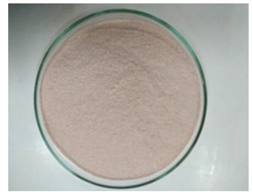
Fig. 3: Chitosan powder after deacetylation of chitin