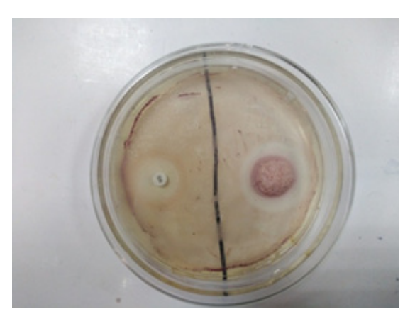
Fig. 4: Inhibition zone of chitosan by a concentration of 0.6g and amoxilline antibiotic disc as (positive control) in culture media inoculated with E. coli bacteria after 24h of incubation