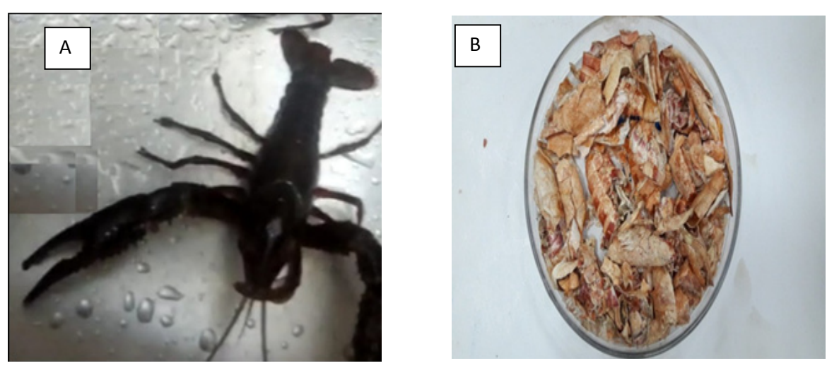
Fig 2: (A) Procambrus clarkii, (B) the dried shells of Procambrus clarkii

Secondary treated wastewater samples collected from UASB/DHNW combined system that installed in Zenein wastewater treatment plant (ZWWTP) at Giza governorates, Egypt, in clean and sterilized polyproplene bottles [16-17]. The samples collected were tested using MPN technique to evaluate the effectiveness of chitosan on E. coli bacteria (before treatment) as control samples, then different concentrations of chitosan (0.09, 0.2, 0.4, 0.6 and 0.8 g) added on 100 ml secondary treated wastewater, then shaked for 30 min at 25°C at 250 rpm, then filterated. The filterate of each untreated and treated samples with different concentration were examined by MPN