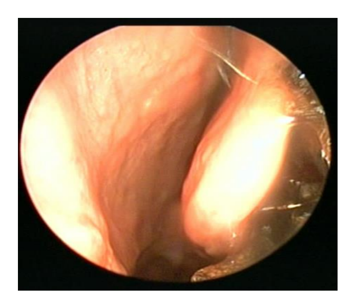
Fig. (2): Left absorbable nasal side spacer (nasopore) two weeks postoperative with minimal crustion and synechiae (S=septum, MT=middle turbinate)