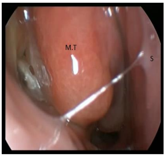
Fig. (4): Right middle meatus packed with absorbable nasal side spacer (nasopore) two months postoperative by endoscope with no synechiae (M.T=middle turbinate, S=septum)