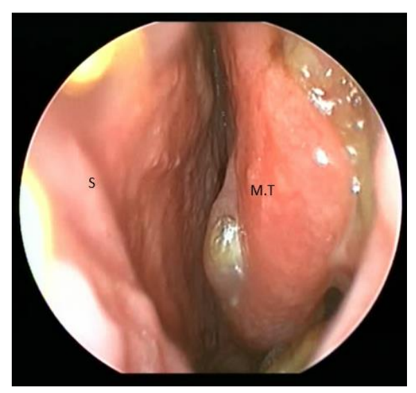
Fig. (3): Left absorbable spacer (nasopoe) showing less synechiae one moth postoperative by endoscope (S = septum, M. T= middle turbinate)