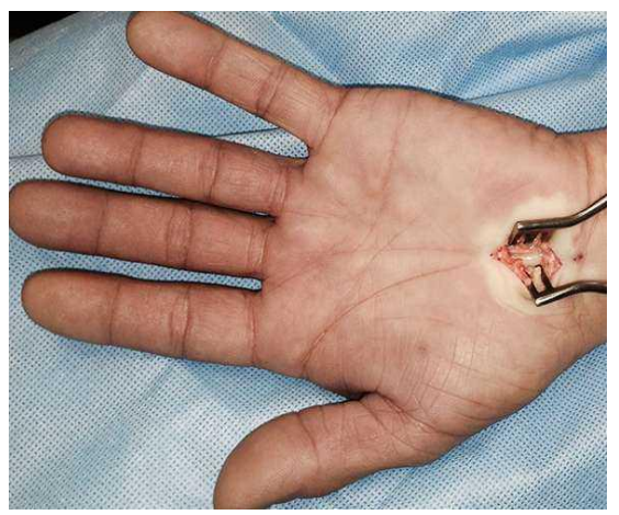
Fig (2): Median nerve after decompression

The results of Fernandes et al. [8] who conducted a clinical trial in Brazil including 15 patients (30 hands) were estimated by