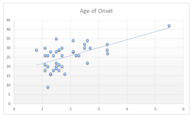
Figure (3): Correlation between serum lactate and age of onset