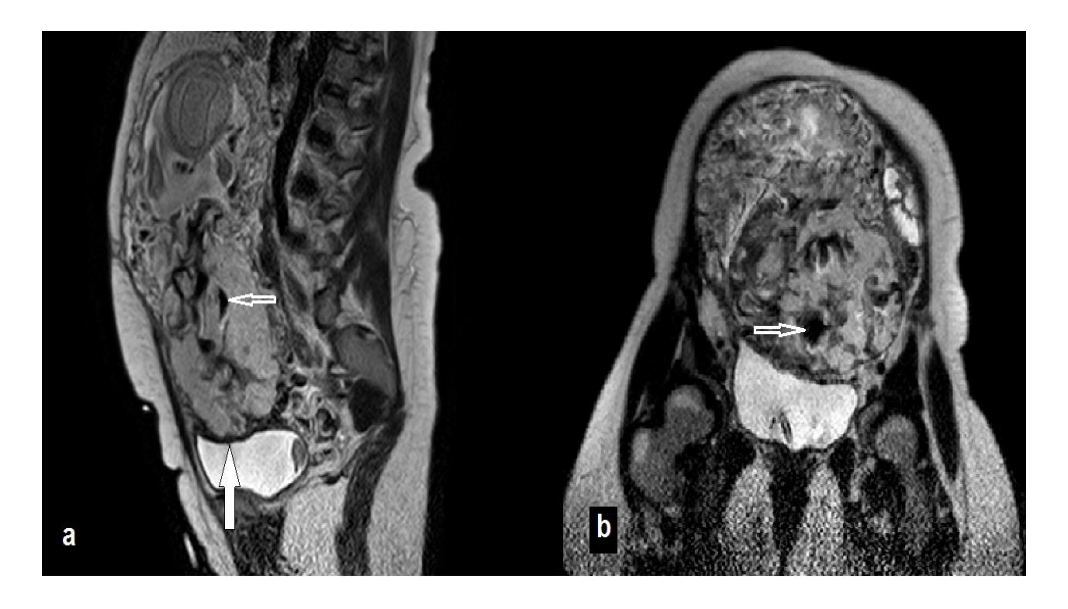
Figure 2. Female, 32 years old, pregnant at 30 weeks, presented with vaginal bleeding with a history of two cesarean deliveries. Placenta percreta (a) sagittal T2WI (b) coronal T2WI, showing anteriorly located placenta completely covering internal os with heterogenous signal intensity, multiple low signal intensity bands (thin arrow in a and b) and markedly interrupted myometrium with loss of fat plane between placenta and urinary bladder (thick arrow in a). Operative findings and pathology: Placenta percreta