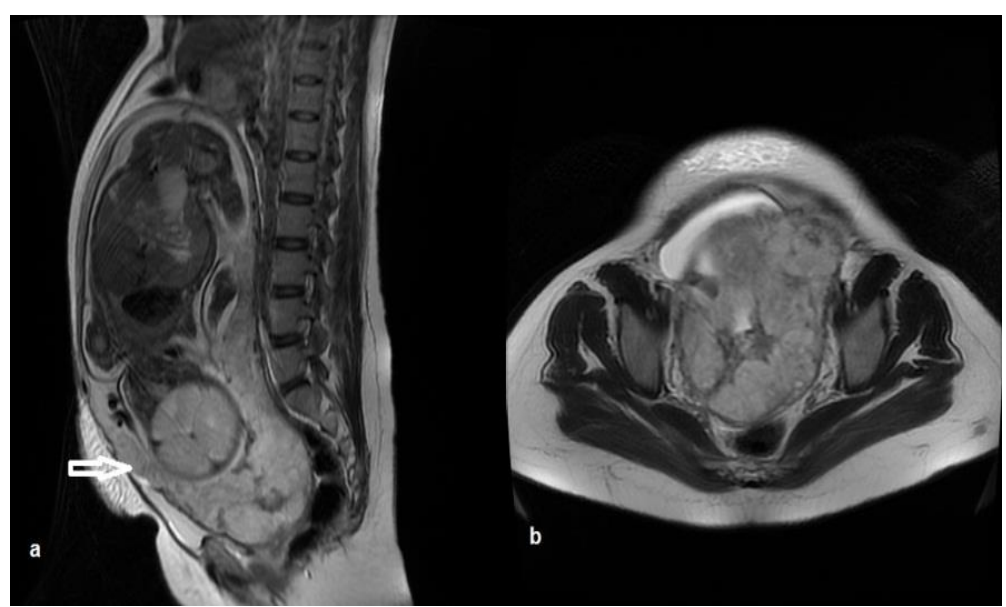
Figure 1. Female, 28 years old, pregnant at 33 weeks, presented with pelvic pain with a history of previous cesarean delivery. Placenta accreta (a) sagittal T2WI, (b) axial T2WI showing anteriorly located placenta completely covering internal os and adherent to myomerium in the lower anterior segment (arrow in a) without invasion and with preserved interface between uterus and UB. Operative findings and pathology: Placenta accreta