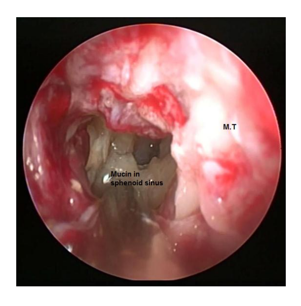
Figure (1): Endoscopic view of thick tenacious allergic mucin in the right side of the nasal cavity. M.T:Middle Turbinate