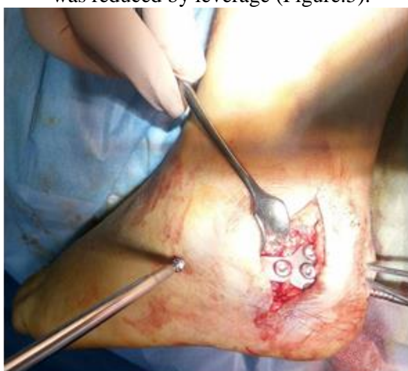
Fig. (5): Minimally Invasive Plate Osteosynthesis (MIPO).

the calcaneal tuberosity from the lateral side and traction was applied along the long axis of the foot to correct the varus and length of calcaneus while the posterior articular surface was reduced by leverage (Figure.5).