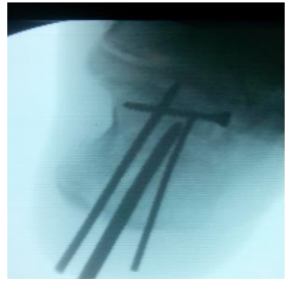
Fig. (3): Fixation of the primary fracture using cannulated screws.