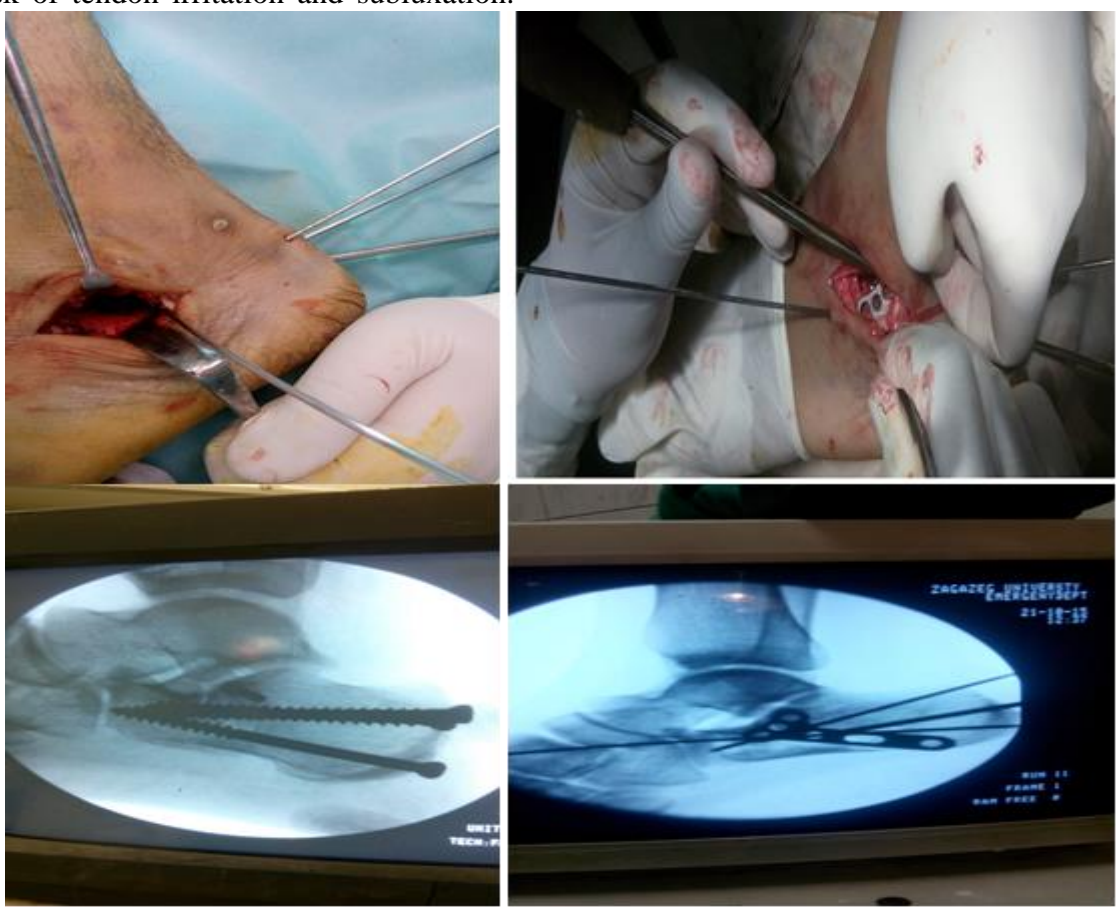
Fig. (4): Sinus tarsi approach.

Because the sural nerve is largely avoided, the risk of postoperative neuralgia or neuroma formation is minimized. along a line from the tip of the fibula to the base of the fourth metatarsal (Figure 4). The extensor digitorum brevis is retracted cephalad to permit exposure of the sinus tarsi and direct visualization of the posterior facet of the calcaneus.