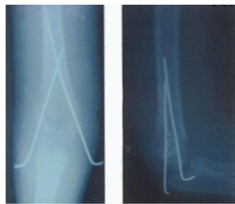
FIG-2: Radiograph with cross k-wire group B