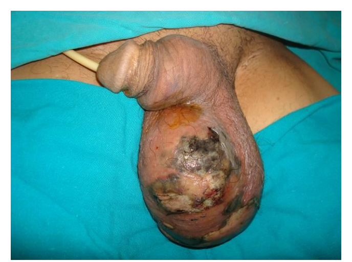
Figure (1): Fournier' gangrene in 67 years male patient

On follow up of the 4 groups of patients included in this study we have found that the size of scrotum was reduced in groups A, B and C while in group D the size of the scrotum is not significantly reduced with satisfactory aesthetic outcome to both surgeon and patient.