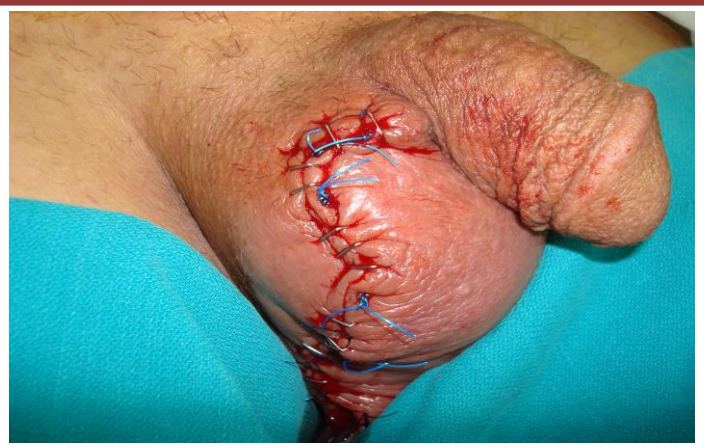
Figure (3): Fournier gangrene closed by secondary suture