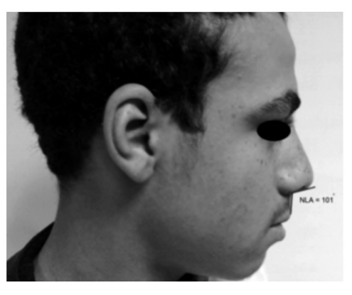
Fig. (6): Postoperative nasolabial angle = 112^{\circ} .