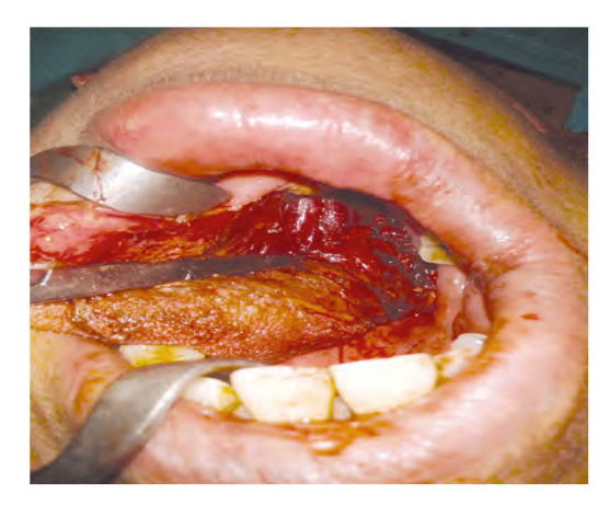
Fig. (1A): Defect after compartmental tongue resection.

defects while tunnelling of SMF lateral to mandible in cases of buccal, retro-molar or alveolar defects (Fig. 1). Donor site and neck incision were closed in layers after hemostasis and insertion of suction drains.