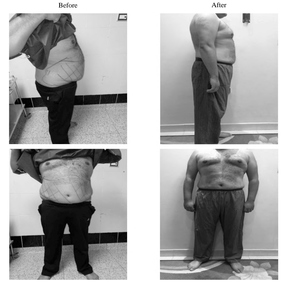
Fig. (4): 39 years old male patient with history of type 2 diabetes 2 years ago with dyslipidemia before and after 5 months of abdominal liposuction.