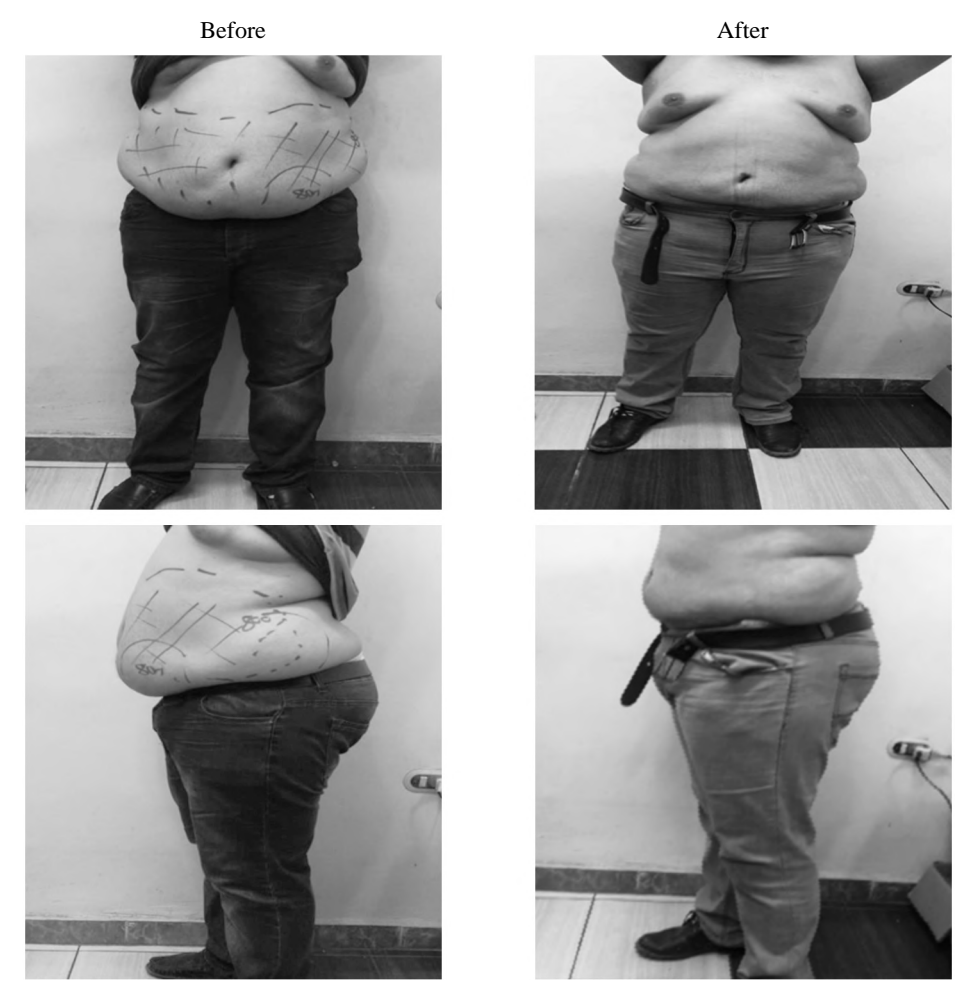
Fig. (5): 44 years old male patient with history of type 2 diabetes from 1 year with hypertension and dyslipidemia before and after 4 months of abdominal liposuction.