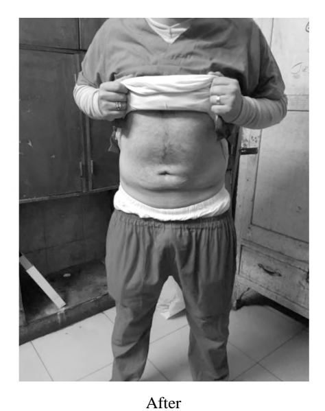
Fig. (3): 37 years old male patient with history of type 2 diabetes 4 years ago with no other disease before and after 3 months of abdominal liposuction.