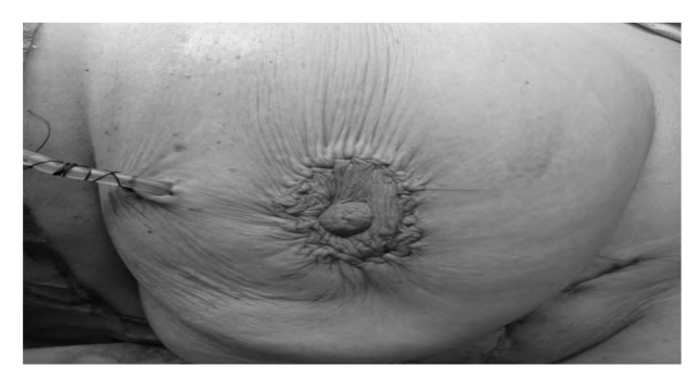
Fig. (4): Post-operative picture of round block technique closure with drain inserted.