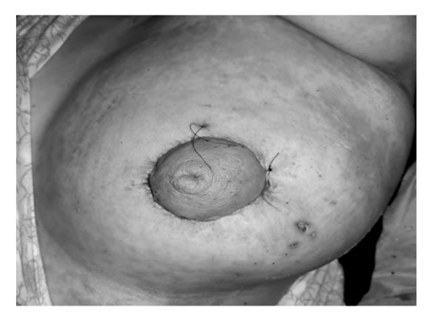
Fig. (2): 1 st post-operative after the operation of round block technique excision of benign breast lesion.