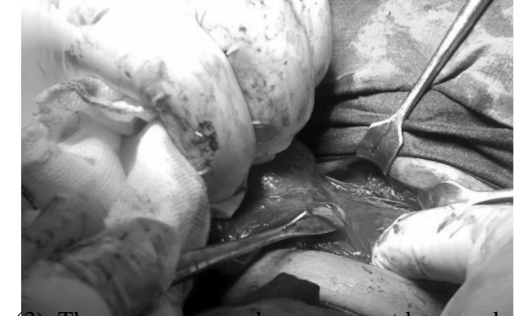
Fig. (3): The orange arrow show recurrent laryngeal nerve and green arrow show parathyroid gland.

Fig. (1): ROC curve of PTH reduction in hypocalcemia. Fig. (2): Identification and preservation of parathyroid gland.