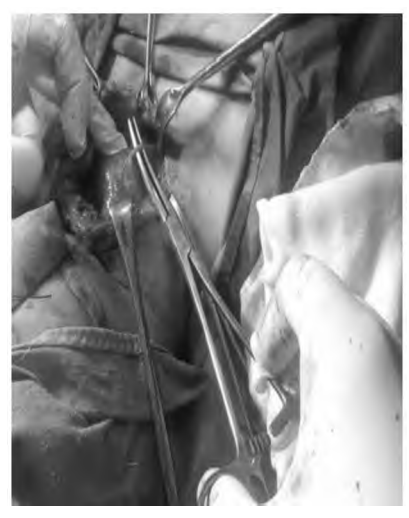
Fig. (1): Ligation of the middle thyroid vein.