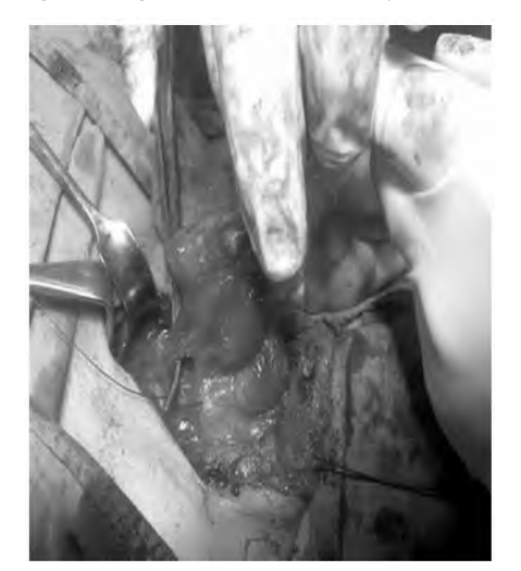
Fig. (2): Ligation of the inferior thyroid vessels.