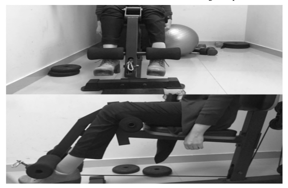
Fig. (2): Knee extension machine used for 1-RM Estimation.

Maximum load with which 1 repetition of the exercise could be completed without pain (using a knee extension amplitude between 90° and 0° of knee flexion. Patient performed up to five attempts of a unilateral knee extension (dominant limb). This exercise was done using ankle weights and progressed to a knee extension machine based on the patient's tolerance with intervals of three to five minutes between attempts. The 1RM test was performed as a pre-test and the training load is then adjusted accordingly [19]. These criteria were based on the protocol of a previous study by the American college of sports medicine [22].