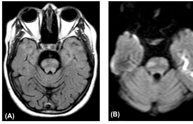
Fig. (1): FLAIR image (A) in an 18 years old female patient known to have remitting-relapsing MS presented with relapse, showing multiple ill-defined faint hyperintense lesions involving the anterior part of the pons on both sides. In DW images (B), only the large lesion in the right side of the pons shows restricted diffusion.

The application of the MTC sequence increased the sensitivity for detection of Gadolinium enhanc-