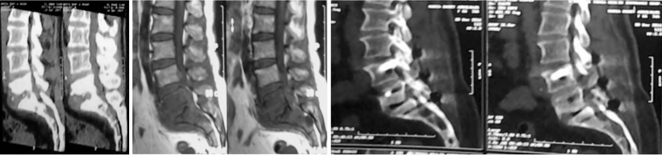
(A): CT spine on admission