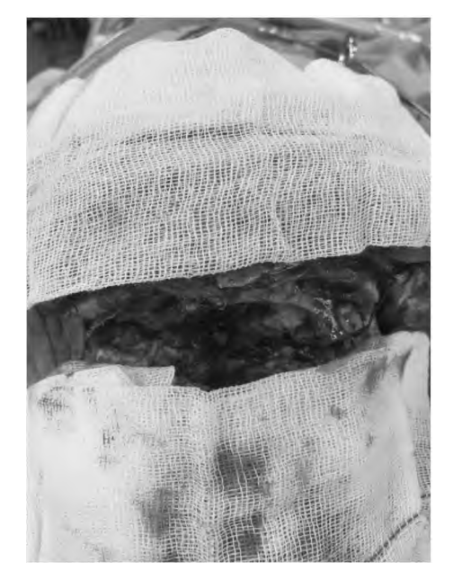
Fig. (1): Intraoperative photograh of bilateral subfrontal approach to remove OGM.