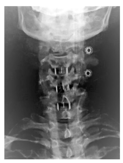
Fig. (1): A case with C 4-5 to C 6-7 3 levels PEEK cage alone fusion at 9 months follow-up showing good fusion.