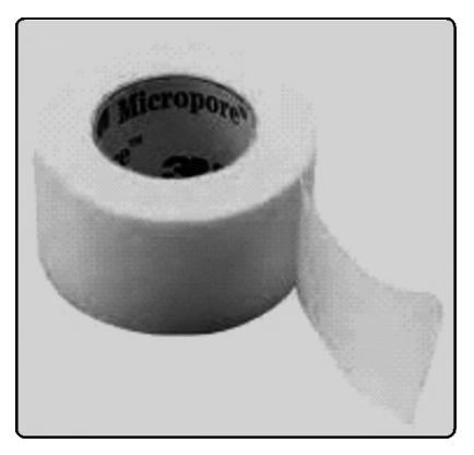
Fig. (2): Microrope Tape.

care (dressing) 30 minutes 3 sessions/week for 12 weeks.