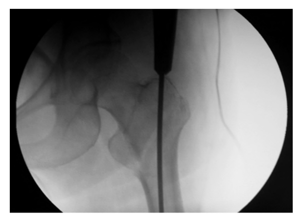
Fig. (1): Entry point at the tip of the greater trochanter.

the greater trochanter. The correct entry point (Fig. 1) is located at the junction of the anterior third and posterior two-thirds of the tip of the greater trochanter.