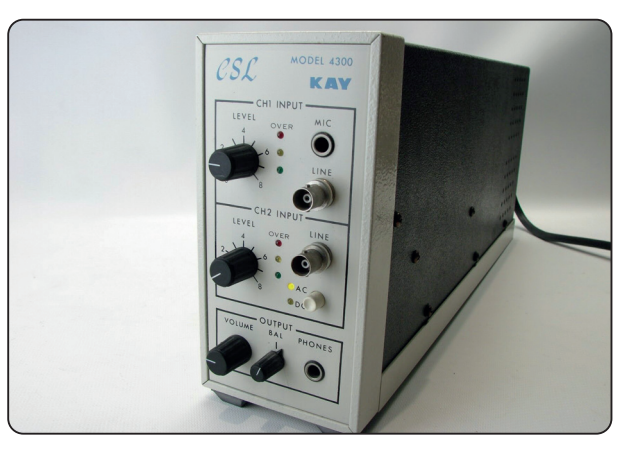
Fig. (3): Computerized speech lab device

Kay Elemetric Model 4300, USA) in phonetic unit ( fig.3 ), ENT Department, kasr El Einy hospital.