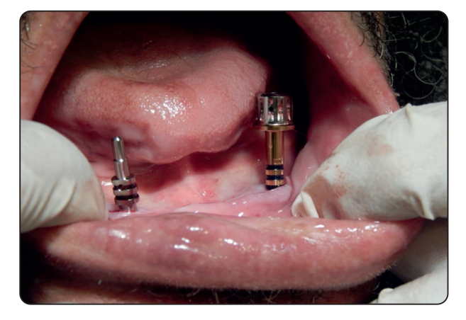
Fig. (1): Implant positions and directions verified with the paralleling tools

In each subject, two mandibular fixtures (Multisystem implant, Italy) were placed at the canine region following the surgical procedure (fig. 1).